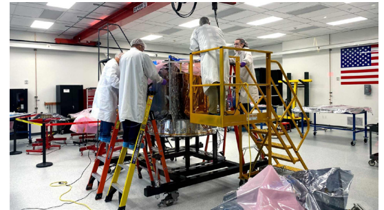
Astrobotic Technologies staff work to configure the Peregrine lunar lander.