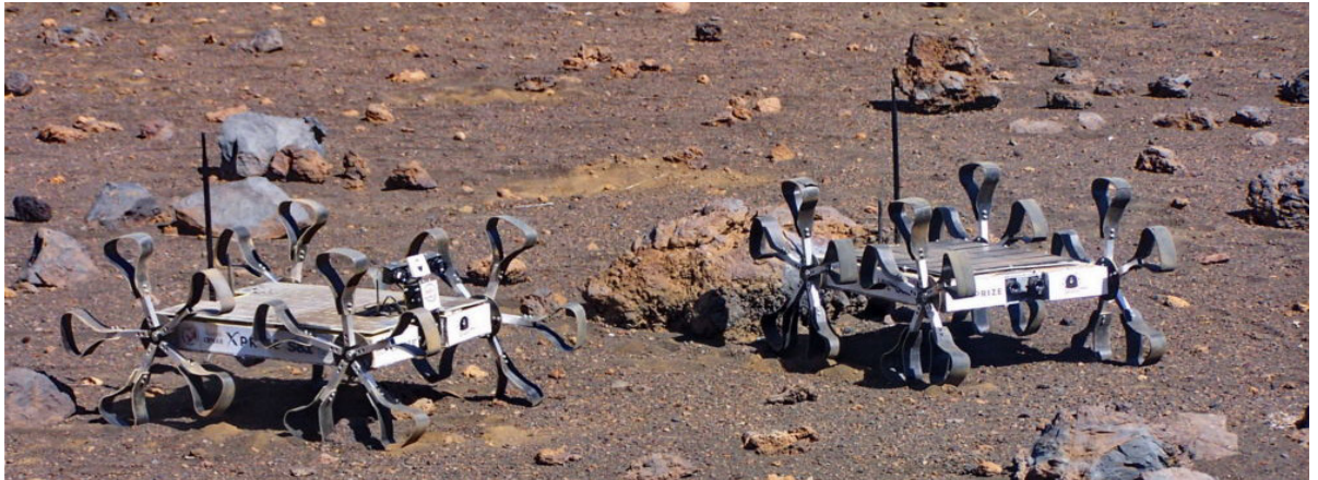
PLWS prototypes navigate “lunar” terrain in a field test at Mauna Kea, Hawaii.

While seeking other opportunities to fly the PLWS, Puli Space continues its work on a low-cost, lightweight planetary rover. The company has put a prototype through successful field tests across terrain simulating the Moon and Mars in Hawaii, Morocco, and Austria.