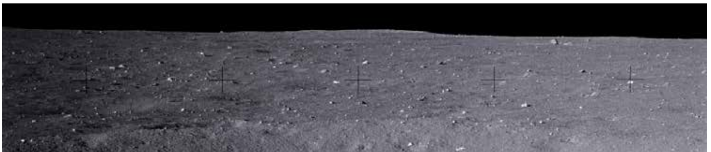
AS11-40-5881 (20 July 1969) --- This 70mm handheld camera's image on the Sea of Tranquility's lunar surface is the first of a multi-framed panorama photographed from a point some 30 or 40 feet west of the plus-Z (west) footpad of the Lunar Module "Eagle." The view is looking toward the southwest showing part of the horizon crater rim that was pointed out as being visible from the Eagle's window.

Is your organization making an impact developing technologies useful to enable sustained lunar surface activities? If so, we'd love to feature you in an upcoming edition of the LSIC monthly newsletter. We are looking for stories specifically highlighting technologies that are advancing the state of the art, processes that are opening pathways to innovation, facilities that could be leveraged for readying technologies, and team members who are championing new ideas for the lunar frontier. Please reach out to us via email to be included.